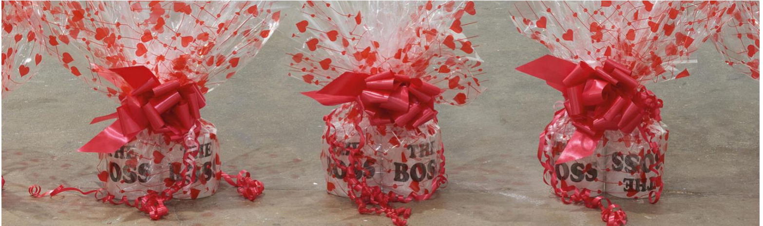
Bosses, 2019.