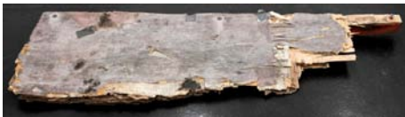
(partially gone) , 2011 Plywood, wood stain, electric tape, 1 x 1 wooden stick 37 x 11 1/2 x 2 1/8 inches 194 E 2nd St., New York, NY 10009