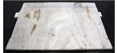
Team , 2013 Plywood, crating wood, 2 x 4 28 x 35 1/2 x 5 inches 83 Grand St., New York, NY 10013