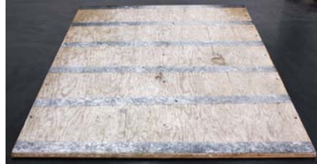
Skowhegan School of Painting and Sculpture (medium) , 2012 Plywood, wooden planks, shims, non-skid tread 47 1/2 x 39 x 8 inches 39 Art School Rd., Madison, ME 04950