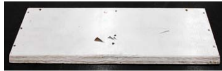
(white with scratches) , 2013 Plywood, white paint 30 x 11 3/4 x 2 inches 194 E 2nd St., New York, NY 10009