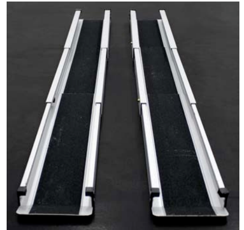
Apexart , 2010 Mabis telescoping rust-resistant aluminum wheelchair ramp with durable non-skid treads two parts, each: 59 1/2 x 6 1/2 x 2 1/4 inches 291 Church St., New York, NY 10013

https://en.wikipedia.org/wiki/Marta_Russell , 2013 Adhesive vinyl 3 x 60 inches