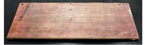
(light brown) , 2011 Plywood, 1 x 1 wooden stick, wood stain 30 x 12 x 2 inches 194 E 2nd St., New York, NY 10009