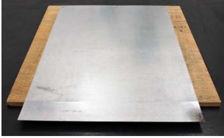
AVA , 2012 Plywood, steel flashing 36 x 28 x 5/8 inches 34 E 1st St., New York, NY 10003