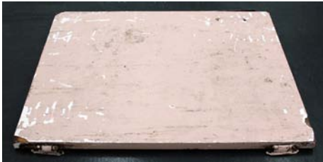
ESSEX STREET (pink) , 2013 Cabinet door, paint 24 x 20 x 3/4 inches 114 Eldridge St., New York, NY 10002