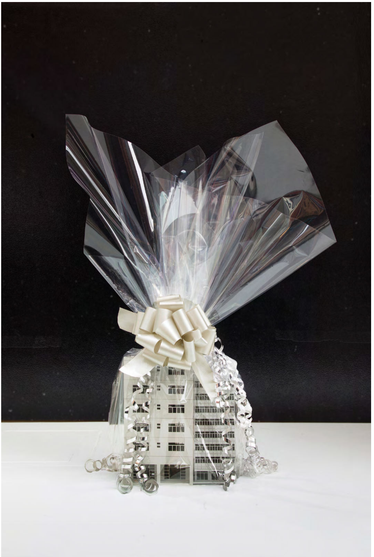
“Power Relations.” Exhibition view at ESSEX STREET, New York, 2019. Detail.