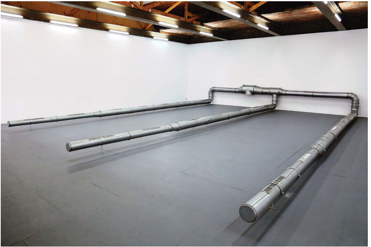
Violets 2 , 2018.