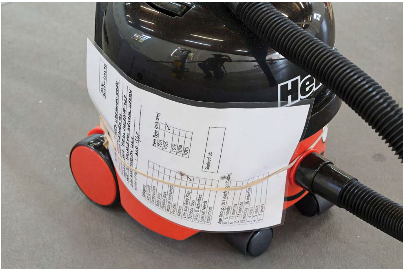
Public Sculpture , 2018. Detail.