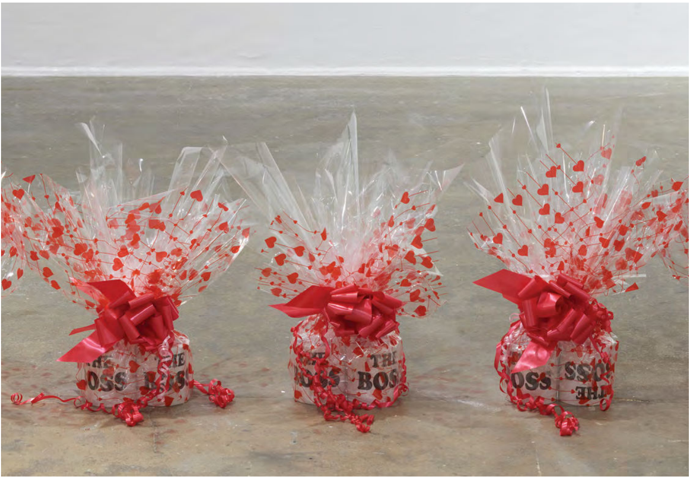
Bosses, 2019. Commissioned and produced by Chisenhale Gallery, London.