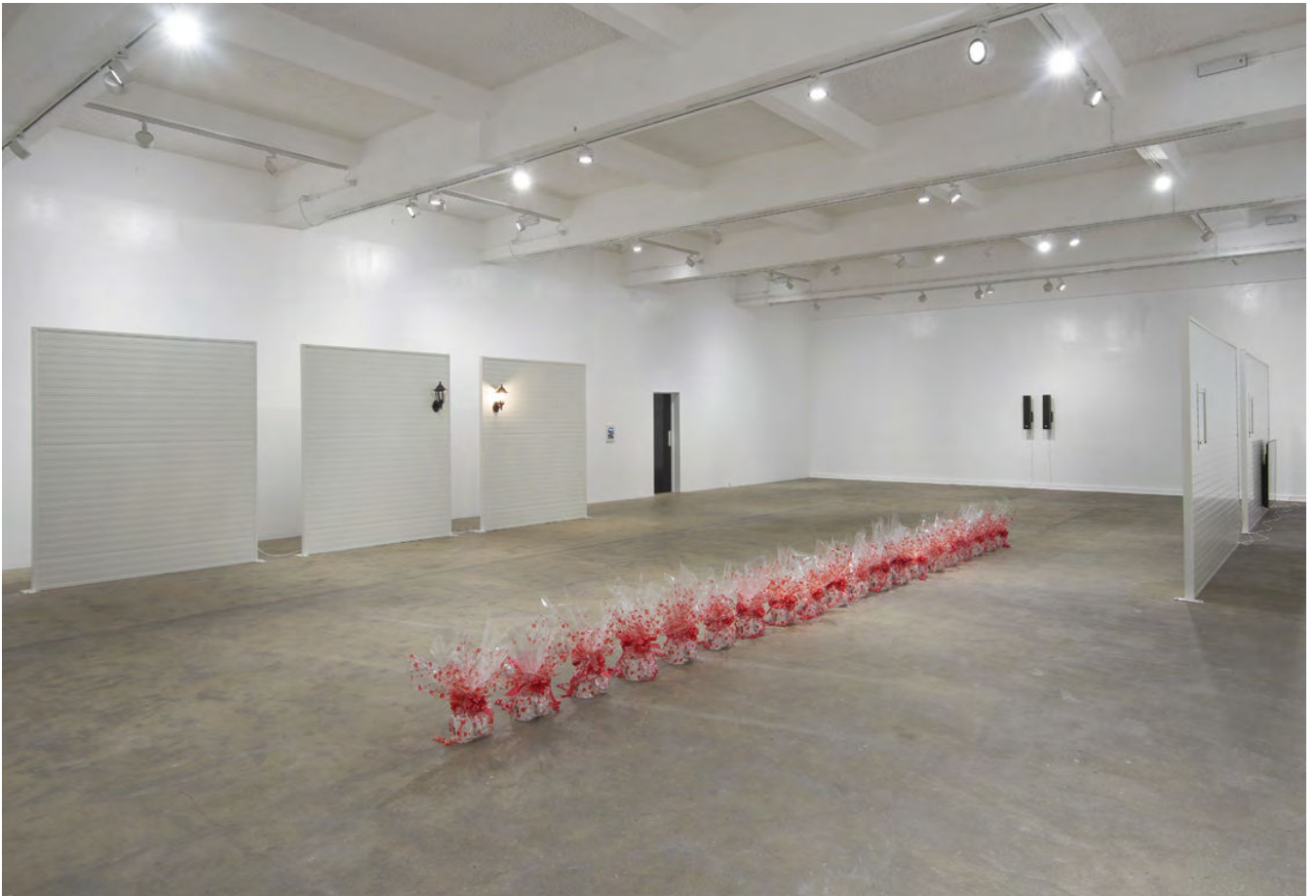
"CONSTITUTION." Exhibition view at Chisenhale Gallery, London, 2019. Commissioned and produced by Chisenhale Gallery, London.